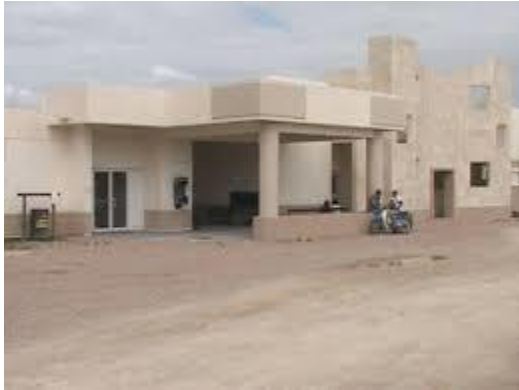
San Ignacio Hospital 804-2066 (public/free hospital)

Dial 911 if there is a serious emergency. You can also directly call the San Ignacio Police Department at 804-2022.